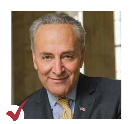
Charles Schumer U.S. Senator for NYS